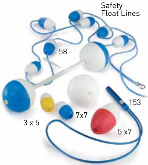
Safety Float Lines